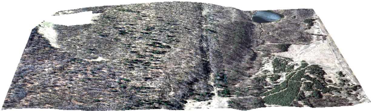
COMBINED PARCEL WITH NO VERTICAL EXAGGERATION