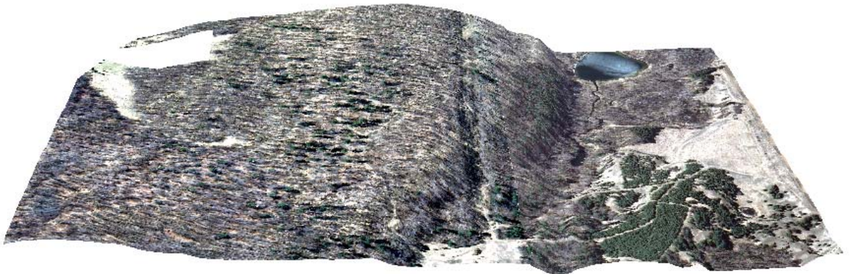
COMBINED PARCEL WITH A VERTICAL EXAGGERATION FACTOR OF 2.0